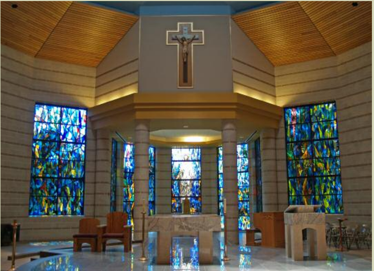
We were honored to supply the liturgical items for Monsignor's Chappetto's beautiful new Church. New Altar, Ambo, Celebrant Chair, Baptismal Font and Pedestal for tabernacle are shown.