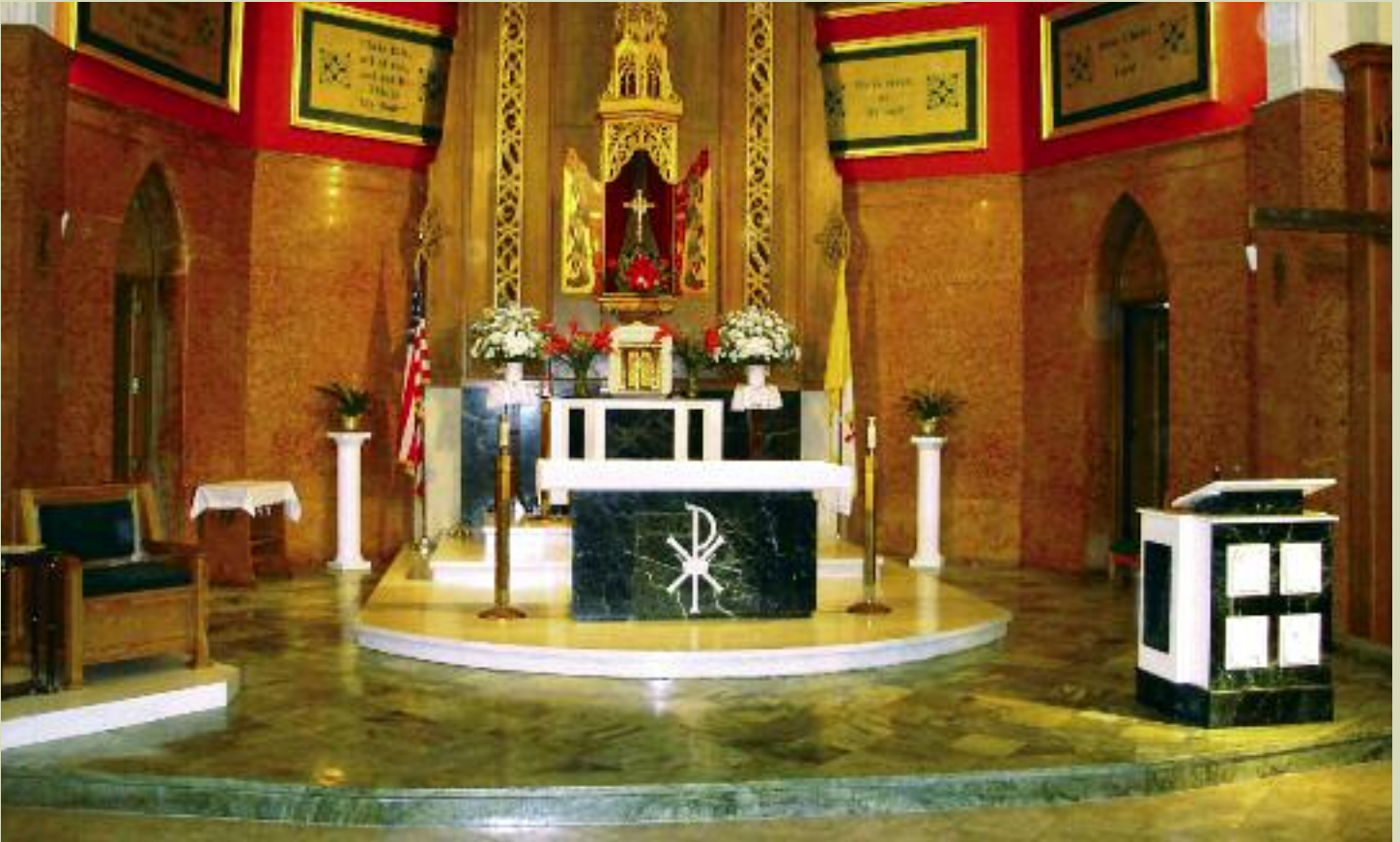
An overview of the Sanctuary depicts a modified Altar, a new Ambo with the four evangelists depicted on front, a new Celebrant Chair on a newly fabricated platform and a new Tabernacle Pedestal. Below Left: A new Baptismal Pool was introduced incorporating the existing font in a cruciform design. Below Right: Close up of Ambo.