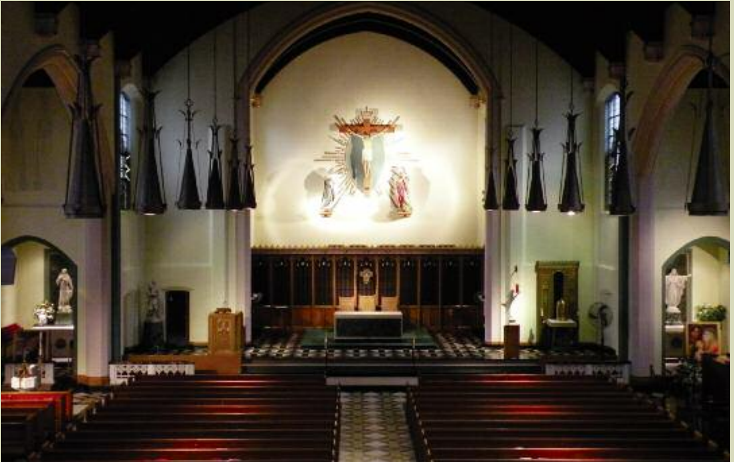
The upper Church received a complete restoration involving new color selections and decorative effects.